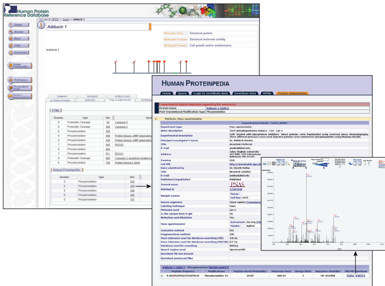
Figure 3. Display of PTM data in HPRD submitted through Human Proteinpedia. Adducin1 molecule page in HPRD shows five novel phosphorylation sites submitted through Human Proteinpedia. Phosphorylation sites are hyperlinked to Human Proteinpedia page with information on the investigator, laboratory and meta-annotation of mass spectrometry experiment. Corresponding MS/MS spectrum for a peptide is also displayed using spectrum viewer developed by PRIDE.

users to generate novel hypotheses or to point out likely molecules involved in a biological process of their interest. Further, the implementation of Human Proteinpedia has transformed HPRD into a community driven database and we hope that this trend will continue so that each and every entry is directly or indirectly verified by the individual experimentalists.